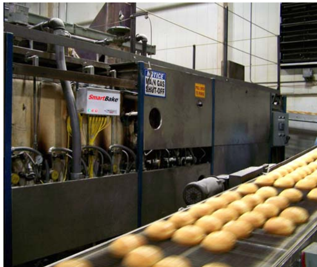
SmartBake™ Running Bun Oven

The standard SmartBake™ system communicates via Ethernet. Other communications options, including DeviceNet and Modbus serial, are also available. SmartBake™ comes equipped to communicate using BOTH Ethernet I/P and Modbus TCP, making it immediately compatible with the majority of PLC and HMI manufacturers. This includes Allen-Bradley (both the SLC 5/05 and Logix family) and Modicon.